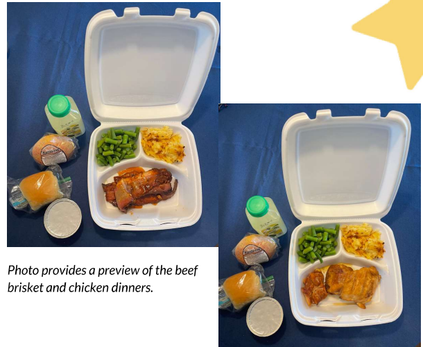
Photo provides a preview of the beef brisket and chicken dinners.

Proceeds benefit Make-A-Wish and the Truck Convoy fundraising campaign.